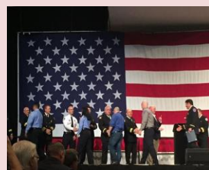
Phoenix Awards Ceremony